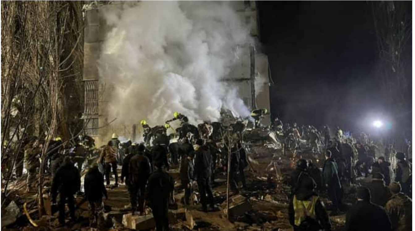
THE CONSEQUENCES OF THE RUSSIAN "SHAHED" STRIKE IN ODESSA